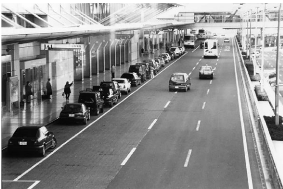
airport terminal / so

In this part, you can move to the next question by clicking on Next . If you want to return to a previous question, click on Back . You will have 8 minutes to complete this part of the test.